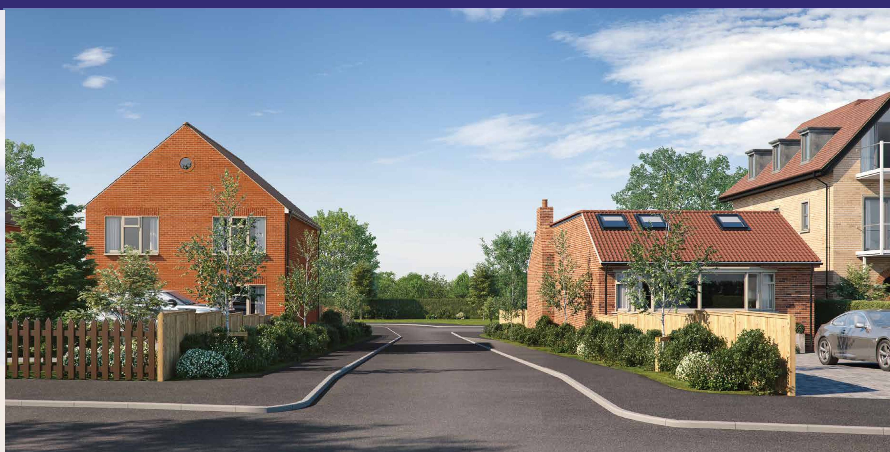
A Computer Generated Image Showing The New Access From Baring Road

The proposal is for the demolition of 367 Baring Road and the creation of an access road to serve a sympathetically designed housing scheme. Landscaping will be carefully considered in order to ensure an attractive environment and create a sense of space, not only for the occupiers of the development, but also for those who bound the site.