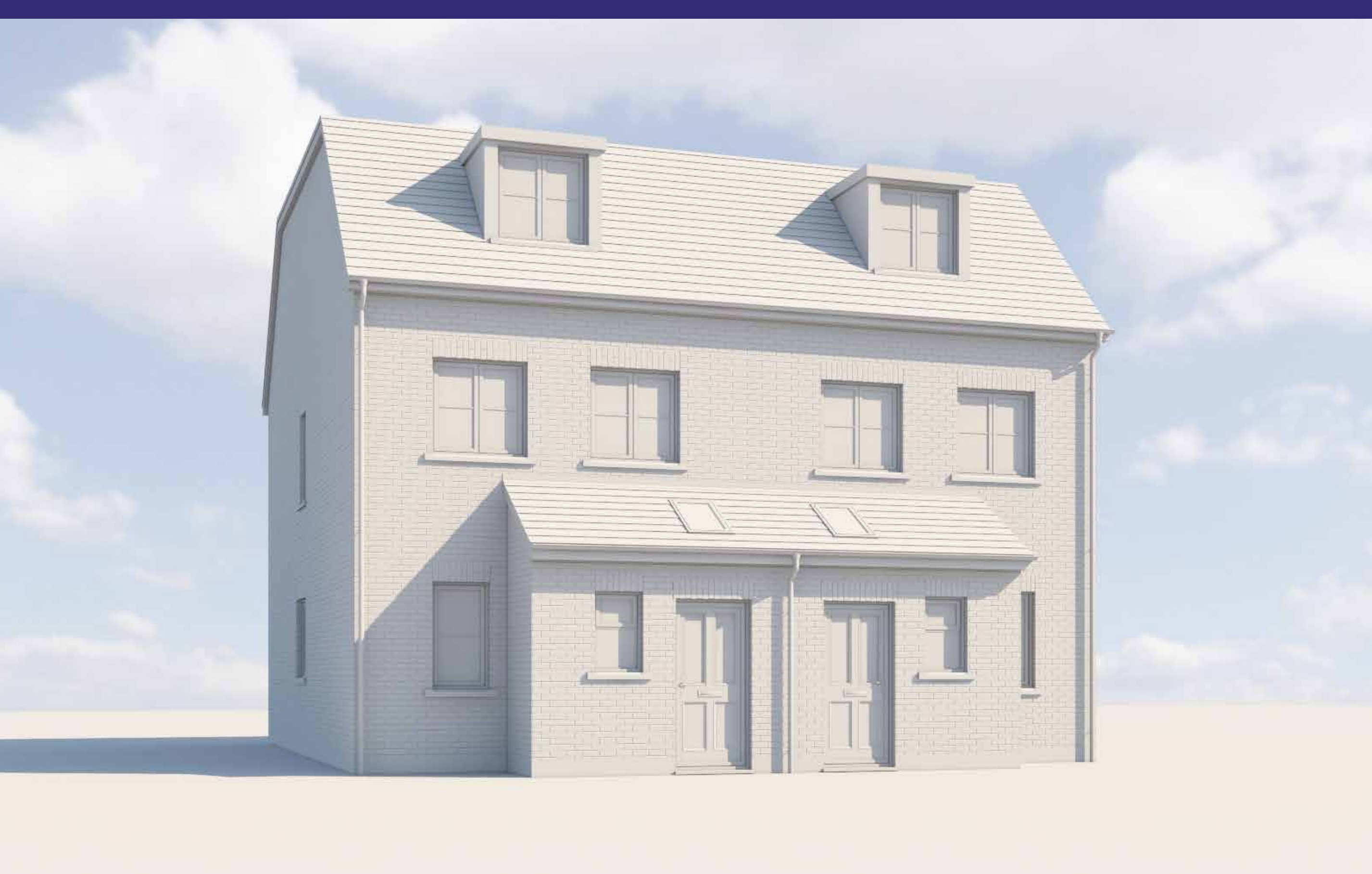
A Computer Generated Image of the Proposed Semi-Detached Houses