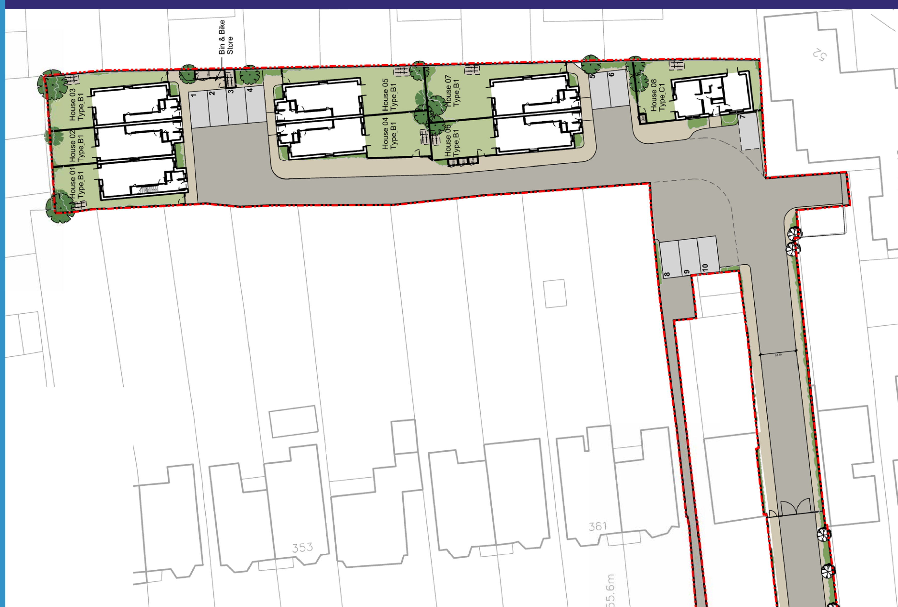
Site Layout Plan