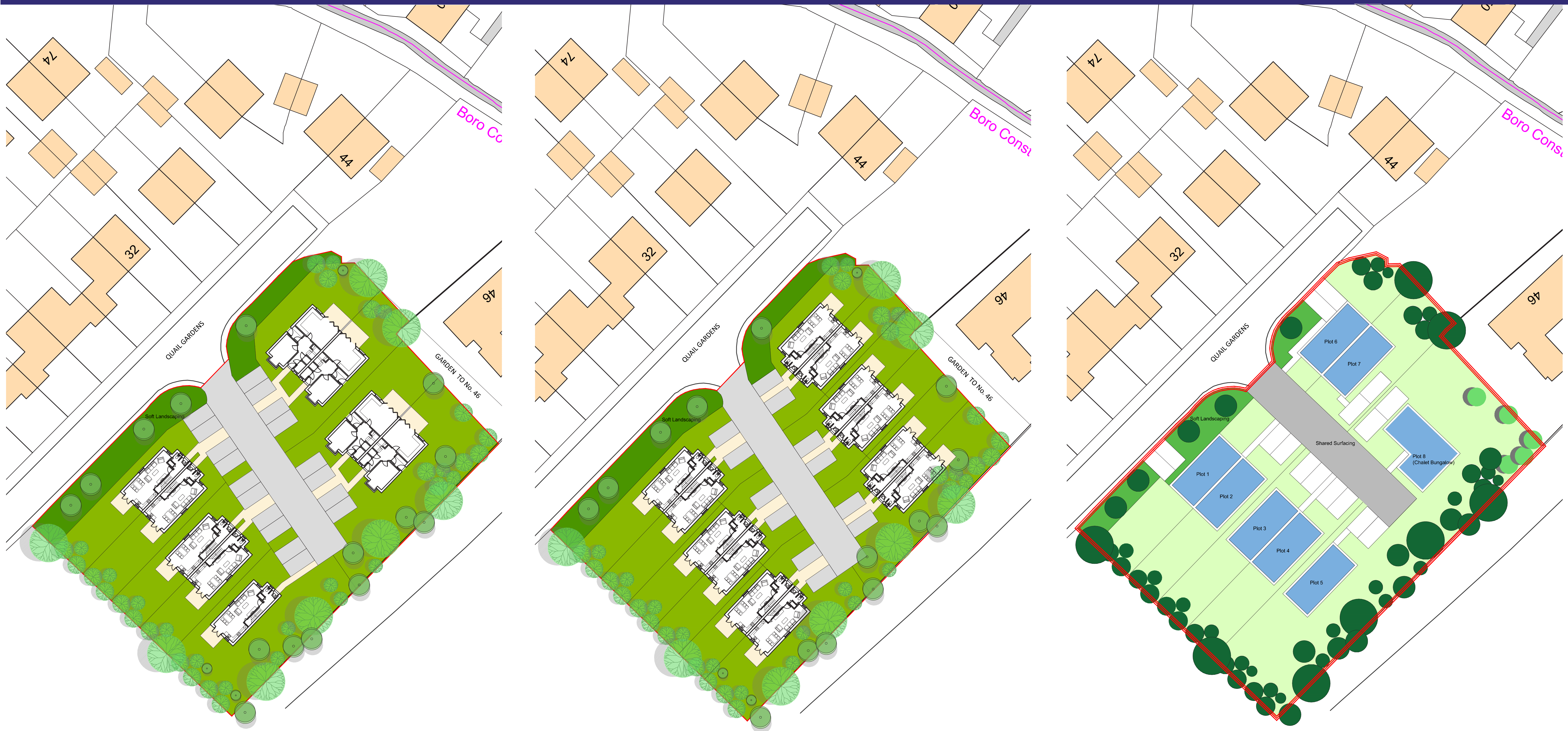
Site Layout Plan Option 1